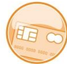
Card processing solutions