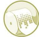
Products for digital print solutions